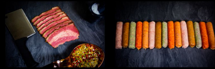
CURED DELI MEATS

Aside from supply of standard meat items, our added value range is the difference maker.